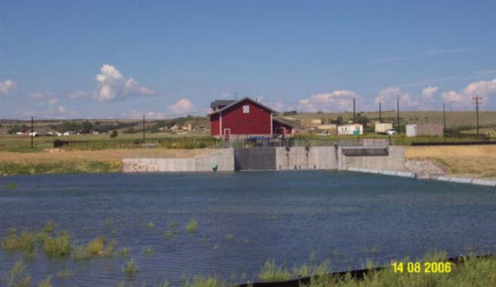
Cherry Creek Diversion Dam

Parker Water & Sanitation District 19801 E. Mainstreet Parker, CO 80138 303-841-4627